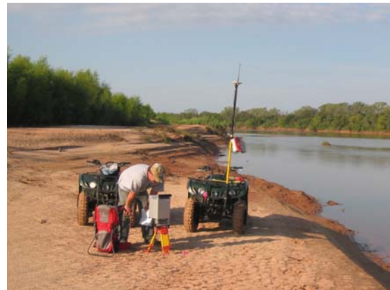
Collection of gravity data

For data processing and analysis, Westshore uses the latest Geosoft Oasis Montaj® software including the GM-SYS module. Data can be presented in any CAD or GIS format.